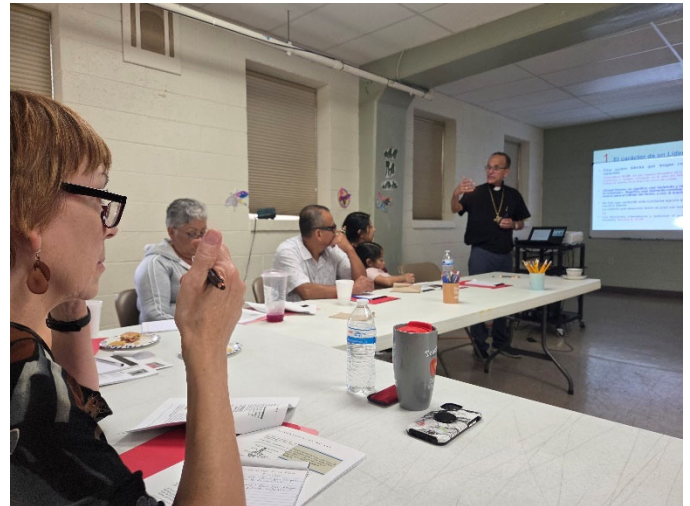
Leadership Workshop for Synod's Hispanic Ministries