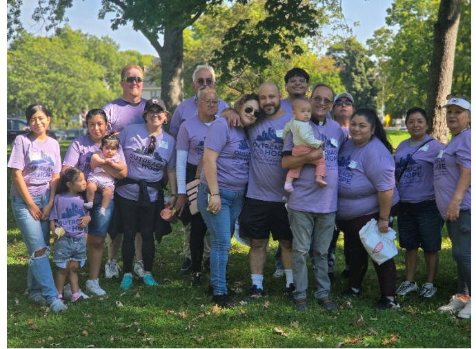
Outreach For Hope Event with Santa Fe, September 27 th @ Washington Park.