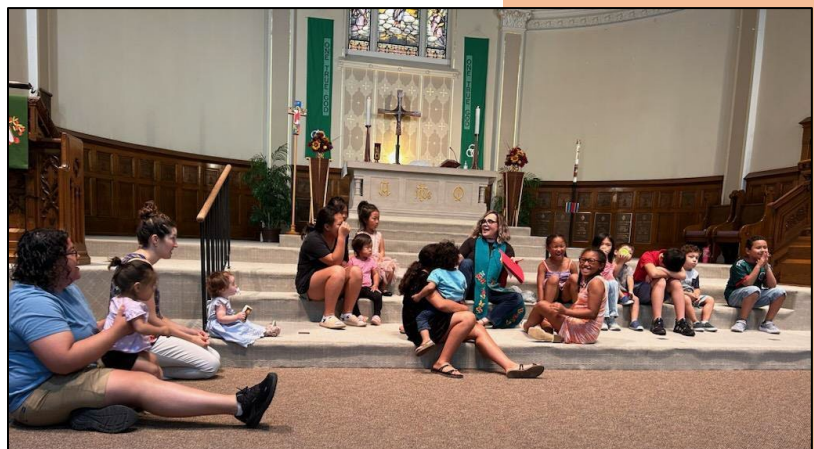
Laughter during the Children's Message