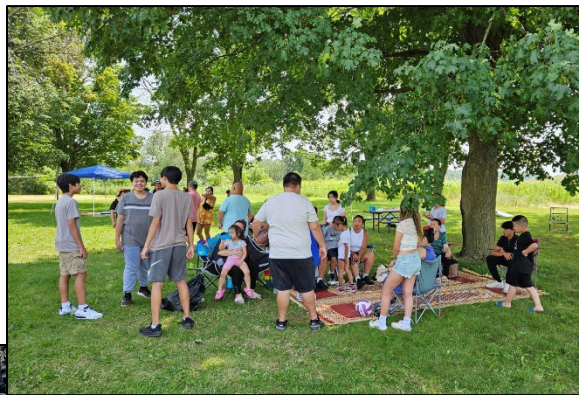
Fun at the Church Picnic