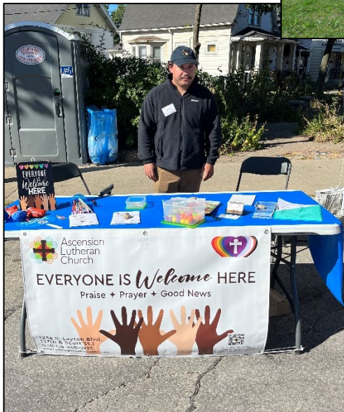
Ascension at the Silver City Fest on September 7 th